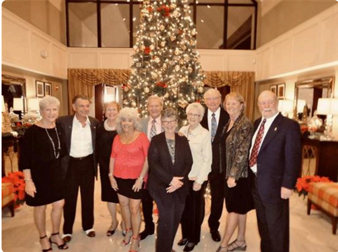
Xmas Gala at KG one of many